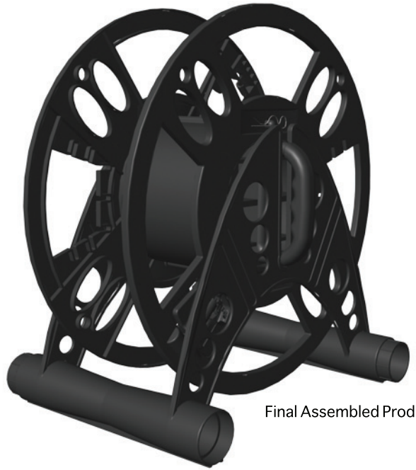
Final Assembled Product